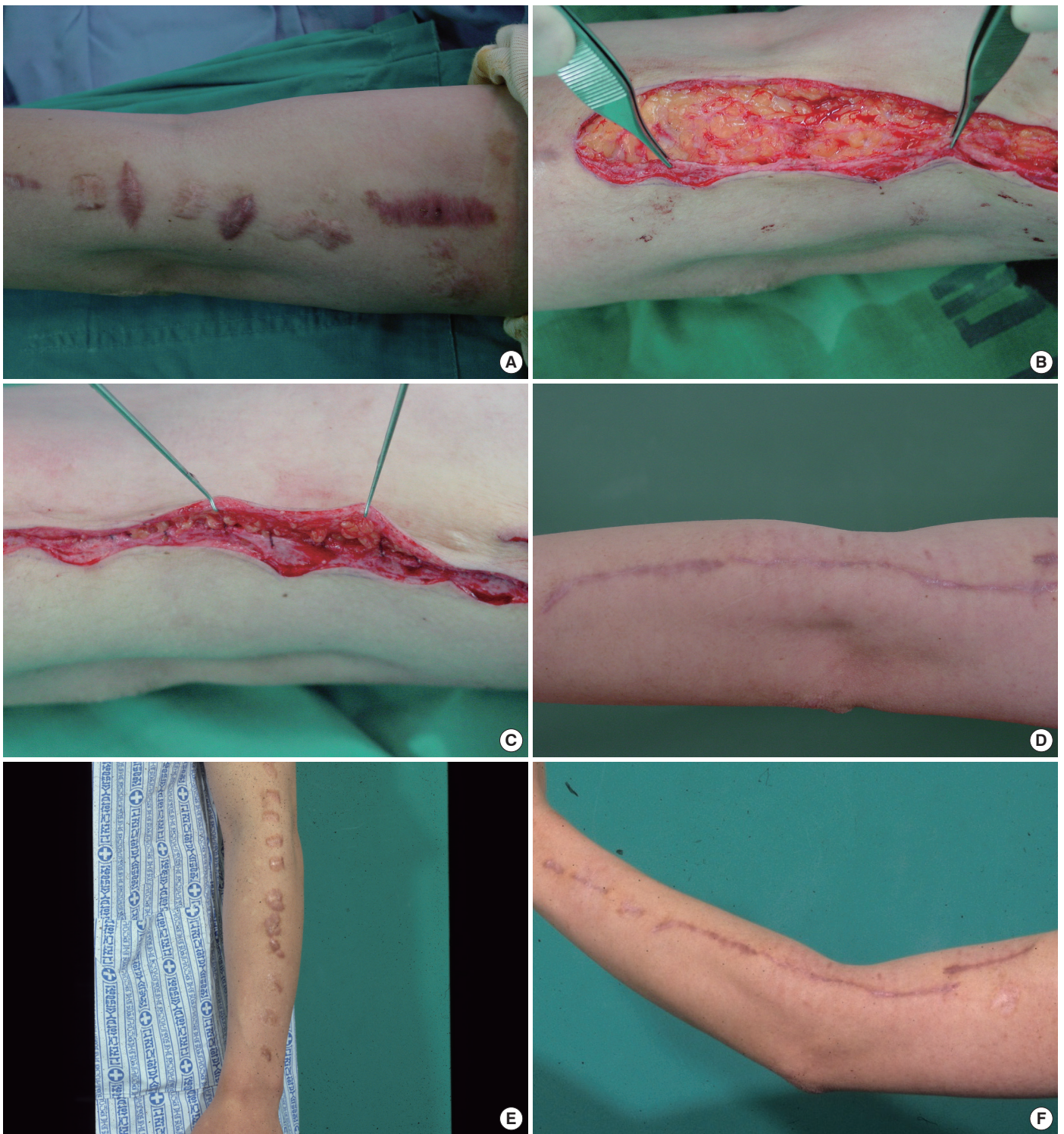
Fig. 1. A 31-year-old man complained of a widened postoperative scar on his left forearm. We excised the epithelium of the scar, leaving an exposed dermal sheet. The dermal sheet component was advanced under the opposite side, to the depth of the undermining, and was fixed in place with several buried interrupted sutures, putting most of the wound tension at the subcutaneous level and bringing the two opposing edges together without tension at the surface. (A) Widened scar on the left forearm, which had been revised twice at other clinics. (B) A dermal platform of scar tissue is prepared at one margin of the incision. (C) Buried sutures between the edge of the underlying dermal flap and the deep undersurfaces of the overlying skin flap. (D) Results at 8 weeks postoperatively. (E and F) Pre- and 8-weeks postoperative photos.